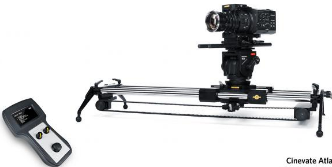
Cinevate Atlas 200 Powered by DitoGear